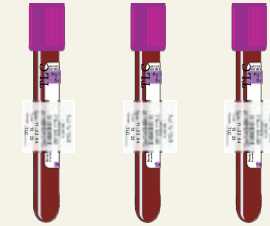
Tube #1 Tube #2 Tube #3

Store samples at 1°C to 10°C. Do not freeze.