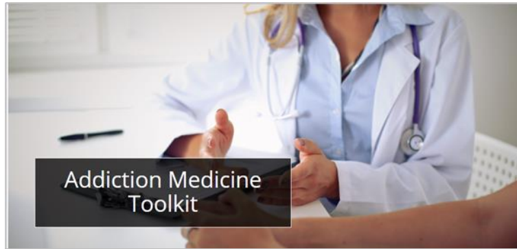
Addiction Medicine Toolkit

https://www.cdc.gov/opioids/addiction-medicine/index.html