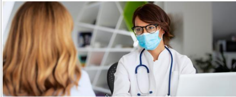
Electronic Clinical Decision Support Tools

Electronic Clinical Decision Support Tools: Safer Patient Care for Opioid Prescribing